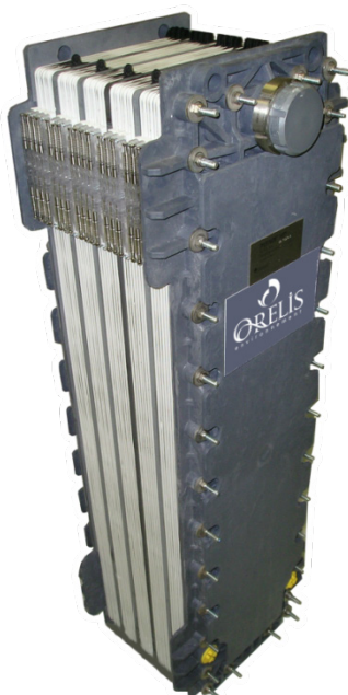
MP4® Module with 3 mm gaskets, 5S8P