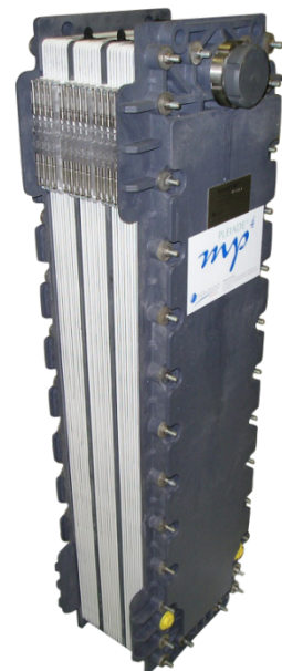
MP4® Module with 1,4 mm gaskets, 3S10P